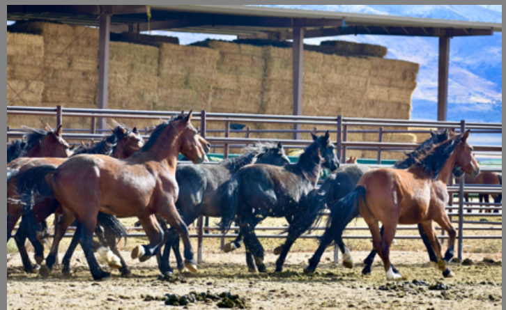
Palomino Valley Wild Horse and Burro Adoption Centre in Nevada

I am extremely grateful to The Wildlife Society-Manitoba Chapter for awarding me with the TWS Annual Conference Travel Award, which ultimately made it possible for me to attend this conference. This conference was the highlight of my year, and I am already counting down the days until the next annual conference in Louisville, Kentucky!